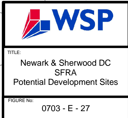
40. Land Adjacent to Dale Lane & Haywood Oaks Lane, Blidworth